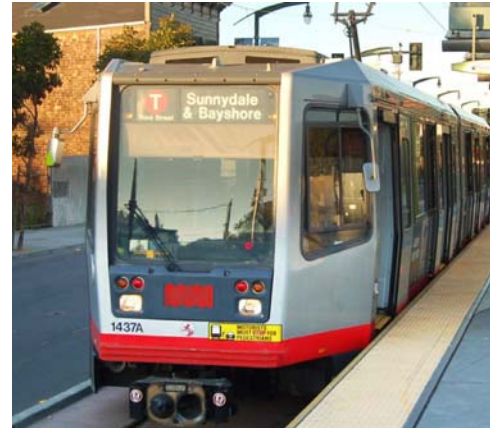
The Central Subway will extend Muni's T Third Line.