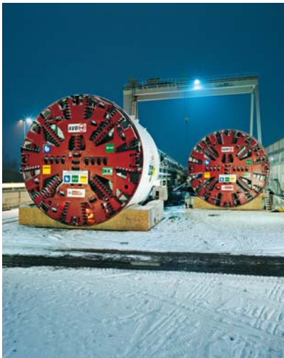
Tunnel boring machines like the two shown here will excavate the tunnel.