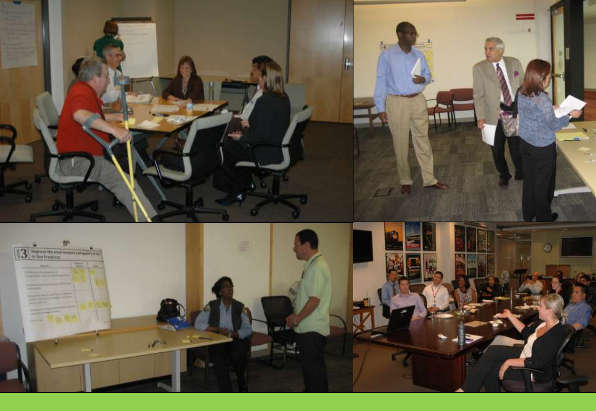
Development of the Plan Elements