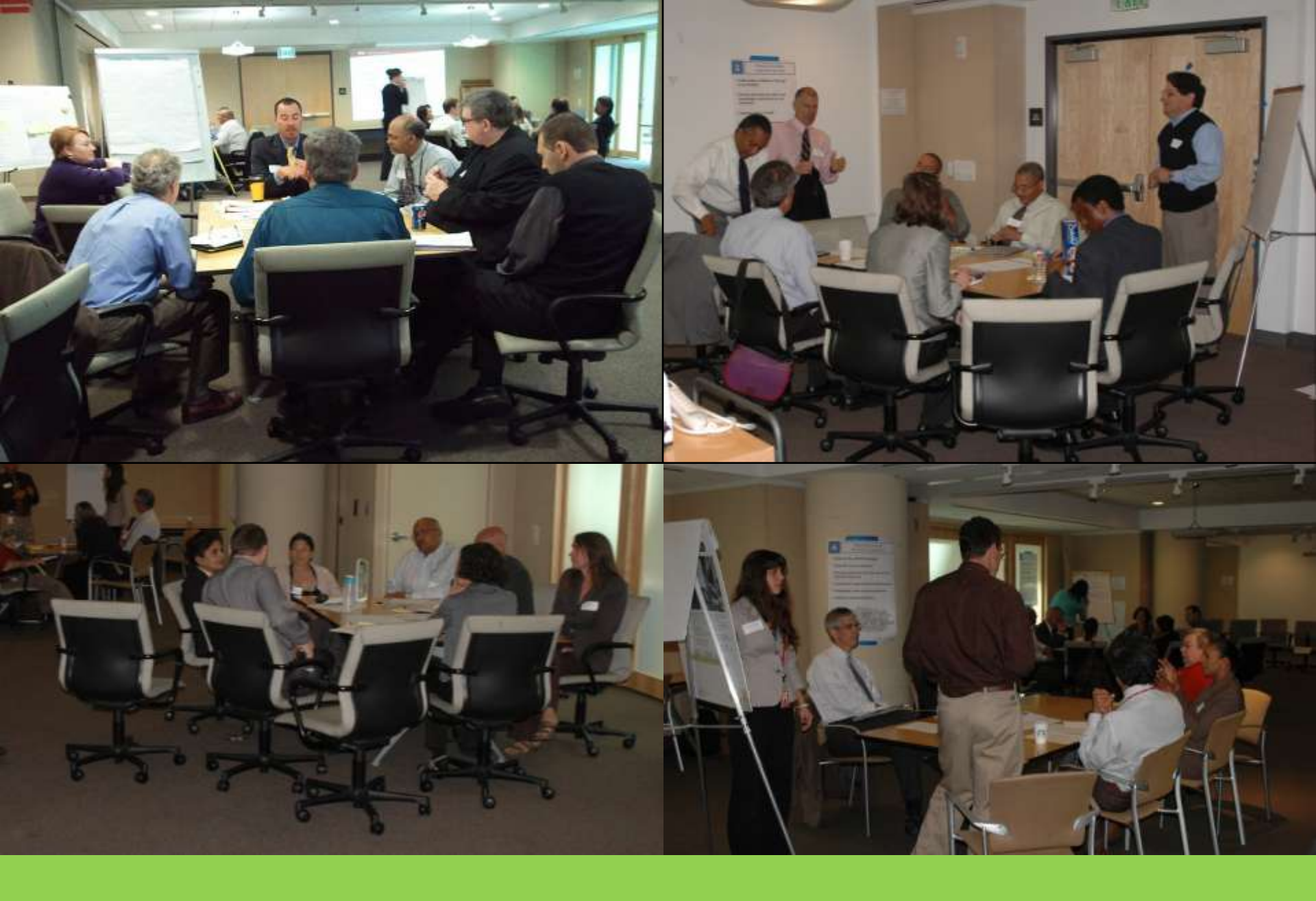
Information Gathering – Surveys and Workshops