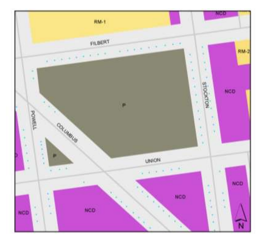
Figure 2. The blockfaces bordering the public park at Washington Square are metered.

Figure 3. On the blocks roughly bordered by Jefferson to the North, Bay to the South, Powell to the East, and Jones to the West parking meters are used to manage the high demand around Fisherman's Wharf, a major trip generator.