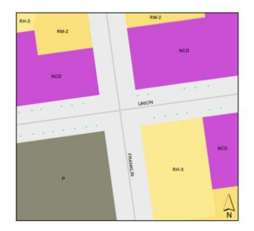
Figure 6. On Union Street at Franklin Street, meters have been added adjacent to parcels of all zoning designations to achieve a reasonable level of continuity and consistency.