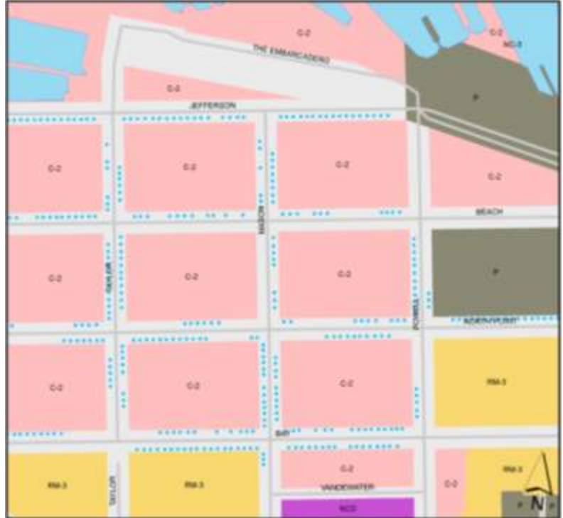
Figure 3. On the blocks roughly bordered by Jefferson to the North, Bay to the South, Powell to the East, and Jones to the West parking meters are used to manage the high demand around Fisherman's Wharf, a major trip generator.

Figure 2. The blockfaces bordering the public park at Washington Square are metered.