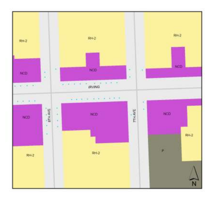
Figure 1. Meters on Irving Street between 7<sup>th</sup> Avenue and 8<sup>th</sup> Avenue round the corners from the commercial district onto the adjacent residential blocks along the commercial parcels.

Note: Points on the maps below represent approximate meter locations. Continuous metering of appropriate areas is subject to varying street conditions (e.g., Muni stops, disabled parking spaces and other colored curb regulations, driveways, bulbouts, parklets, etc.).